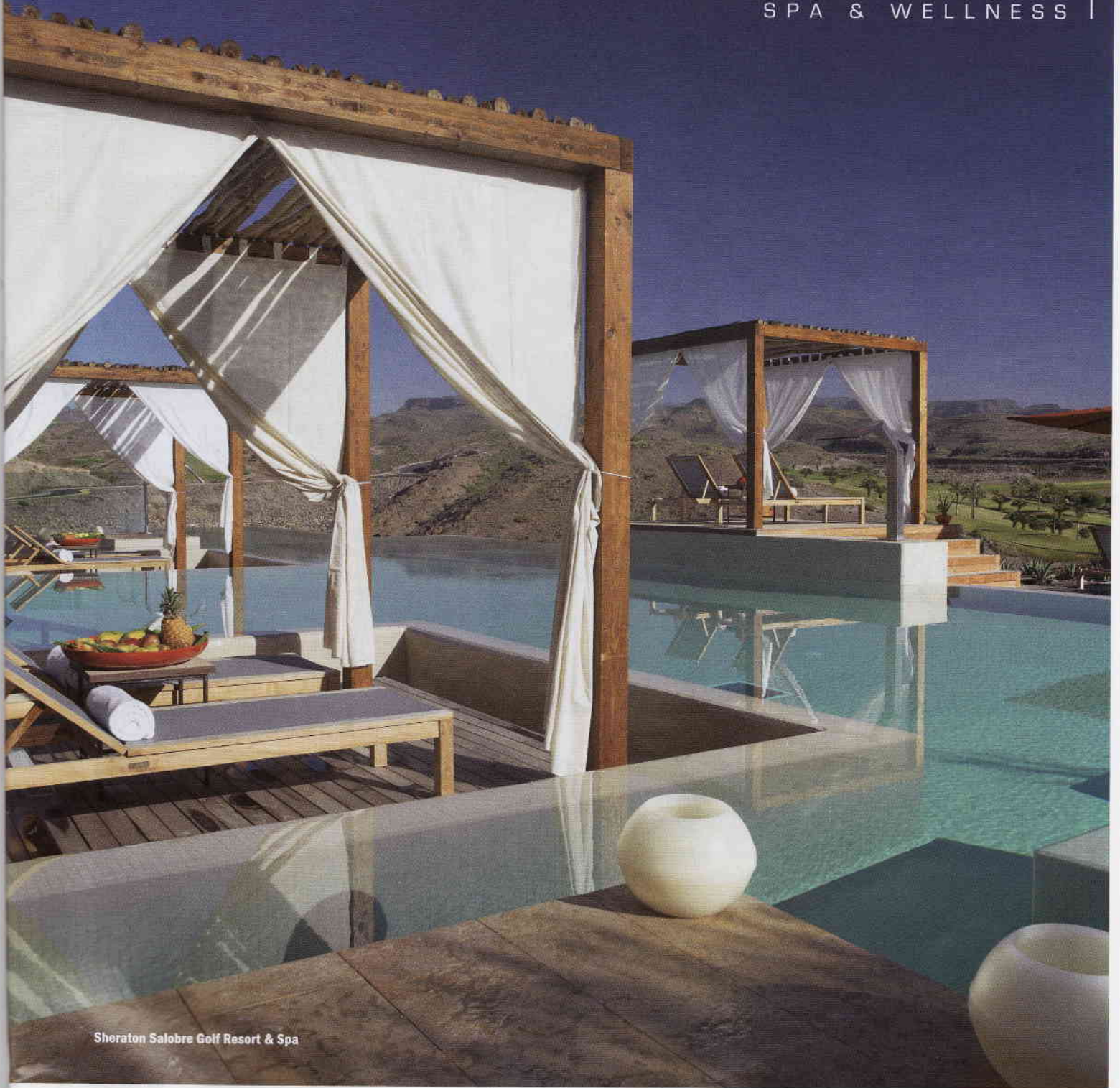
Sheraton Salobre Golf Resort & Spa