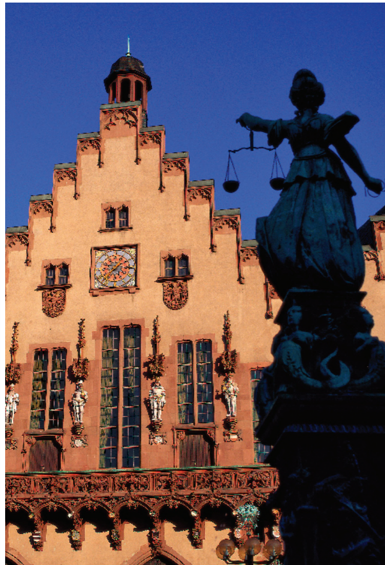
Left The Römerberg is extremely photogenic; Right Kings were crowned in St Bartholomeus' Cathedral; Below Sip apple wine at Apfelwein Wagner