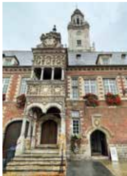
Clockwise from top: From Tardinghenon on Cap Gris-Nez, you can see the white cliffs of Dover in England; the battlefield at Azincourt, as seen from the viewing tower; the Azincourt1415 museum; Hesdin's Town Hall

leisurely ramble through field and forest. Either way, you will be rewarded with breathtaking scenery and tranquillity. The historic market town of Hesdin is worth a stop too, built as a strategic fortified town in the 16th century. You can't miss the grand galleried porch on the Town Hall, but not all Hesdin's treasures are obvious, so call first at the Tourist Office for the town guide. And if you can't resist a floral display, stop off at nearby Boubers-sur-Canche where the whole community pulls together with public plantings and private gardens that provide colour, shape and interest throughout the year. With time for just one more visit before my return trip on Le Shuttle from Calais, I choose Azincourt – or Agincourt, thanks to a mispronunciation by one of Henry V's English knights. The splendid village museum was recently revamped as Azincourt1415 and the story of the epic battle is graphically told through