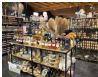
Pick up some moreish goodies at Ferme du Pont des Loups

Hauts-de-France is the official European Region of Gastronomy for 2023, thanks to its quality produce and a commitment to sustainability. In the Avesnois, buy beers, biscuits and a range of specialities from the Nord at Maison Defroidmont in Maroilles www.boutique-defroidmont.fr and from the Ferme du Pont des Loups cheese dairy and shop in Saint-Aubin www.fermedupontdesloups.fr .