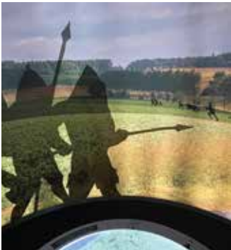
AZINCOURT Step back into the Middle Ages at Azincourt1415 interactive museum and then walk or drive beside the medieval battlefield and absorb the atmosphere of the great battle. www.azincourt1415.com »