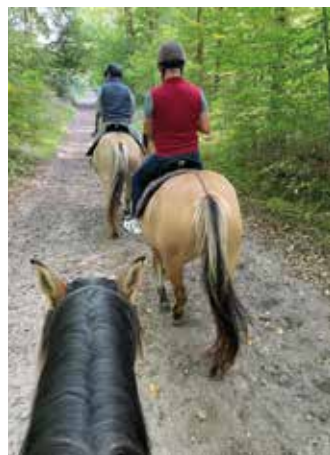
Why not explore the Compiègne Forest on horseback?

Discover the walking trails of the Clairmarais marshland reserve near Saint-Omer or take a boat ride around the nearby Audomarois from Maison du Marais www.lamaisondumarais.com . At Maroilles, download the Baladavesnois app for a guided walk with interactive activities. And in Amiens take a boat tour with commentary through Les Hortillonnages www.leshortillonnages-amiens.com .