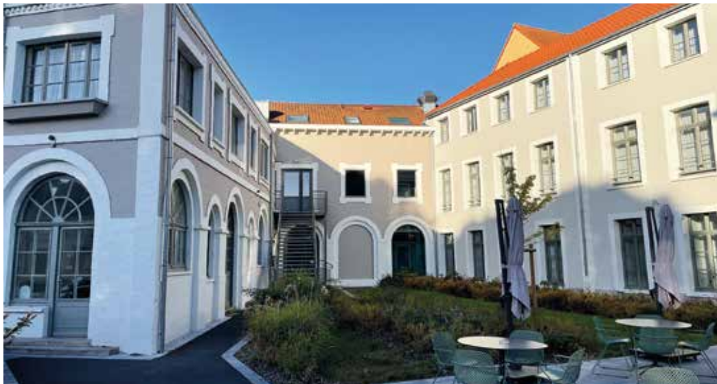
The Mercure Centre Gare is the perfect base from which to explore Saint-Omer

Deep in the Aisne Champenoise, this former hunting lodge from 1869 has three elegant guest suites and public rooms full of