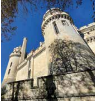
CHÂTEAU DE PIERREFONDS This is an intriguing example of a 19th-century reinvention of the Middle Ages. Take time too to explore the pretty small town below the castle walls. www.monuments-nationaux.fr