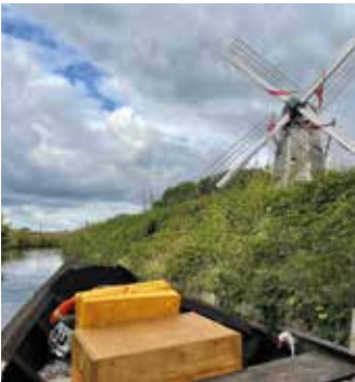
AUDOMAROIS MARSHES Explore the fabulous flora and fauna and the stories of the people who have shaped this wetland market gardening community surrounded by nature. Regular boat excursions available. www.lamaisondumarais.com