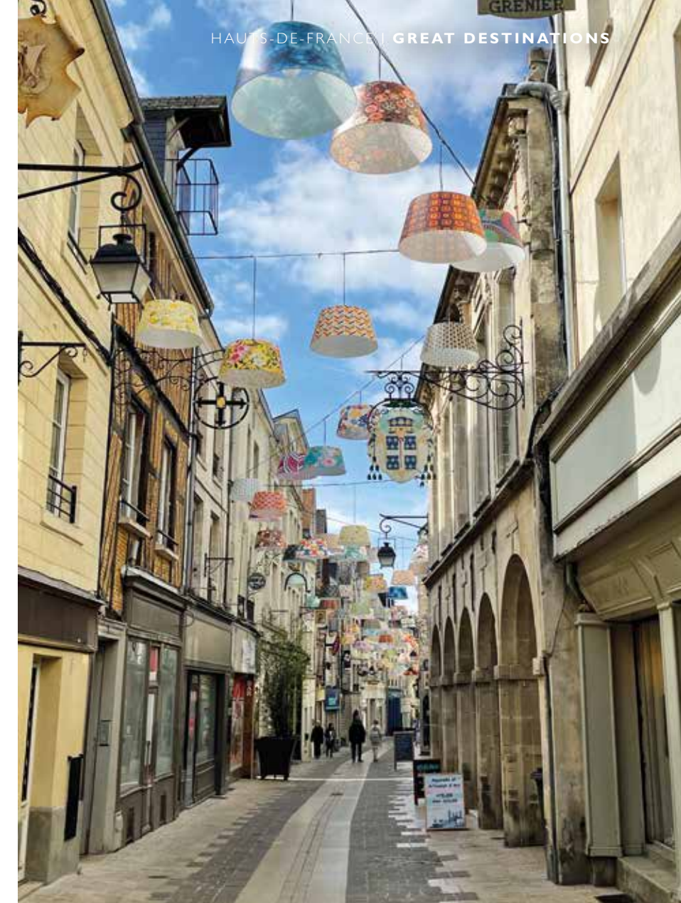
HAUTS-DE-FRANCE | GREAT DESTINATIONS

the power of creative imagination. Don't miss the light show amongst the faux tombs and statues in the cellar.