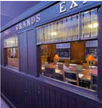
ARMISTICE MUSEUM This forest clearing at Compiègne has a replica of the railway carriage where the Armistice was signed on November 11, 1918, as well as a memorial garden and museum. Open daily from 10am. www.armistice-museum.com