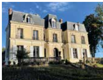
Enjoy elegant accommodation at the Château de Picheny

Indulge in gourmet regional dishes in this equestrian-themed town centre restaurant, with its shady terrace for al fresco summer dining. Fixed price menus and à la carte. Two Michelin forks. www.restaurant-lecurie.com