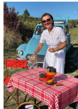
A warm welcome awaits in the vineyards at Champagne Météyer

Major Great War remembrance sites include Thiepval and the Chemin des Dames in the Somme Valley; the Canadian