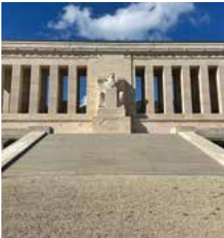
CÔTE 2004 This huge hillside memorial at Château-Thierry honours the American soldiers who gave their lives in the Great War. Also close by is the Aisne-Marne American cemetery at Belleau. www.abmc.gov