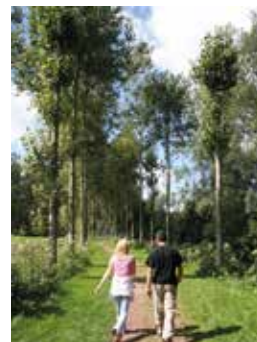
Clockwise from top: Hesdin Forest is a delight to explore; the Ulster Memorial Tower, which stands on what was the German front line during the Battle of the Somme; the stunning Château de Compiègne; walking in the Sept Vallées

stand proud in peaceful rolling countryside, each one worthy of a visit: Thiepval and Péronne, the Lochnagar Crater, the Ulster Tower and many more. And at the heart of it all is Amiens, regional capital and a must-see, not just for its stunning Gothic cathedral and old quarter, but for Les Hortillonnages, an area of market garden plots divided by navigable waterways and accessible to all on guided boat tours.