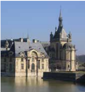
CHÂTEAU DE CHANTILLY History, horses and an outstanding art collection are on offer at this glorious estate with formal gardens by Andre Le Nôtre, plus Chinese and English gardens. Closed Tuesdays. www.chateaudechantilly.fr