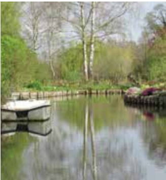
HORTILLONNAGES, AMIENS Small cultivated islands shaped by generations of market gardeners known as 'hortillons' from natural marshland surround the old bed of the River Somme. www.visit-amiens.com