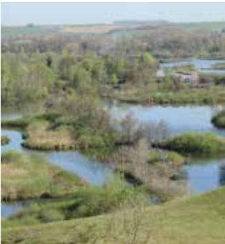
SOMME VALLEY As well as the moving memorials to the victims of the Great War, there are a range of outdoor pursuits here, from river trips and angling to birdwatching, hiking and cycling. www.visit-somme.com