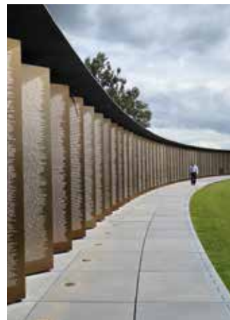
The Ring of Remembrance lists 579,606 soldiers who died in WWI

monument at Vimy Ridge in the north; and the American cemeteries and memorials of the Marne Valley . Immaculate cemeteries and memorials to all nationalities dot the countryside of Hauts-de-France.