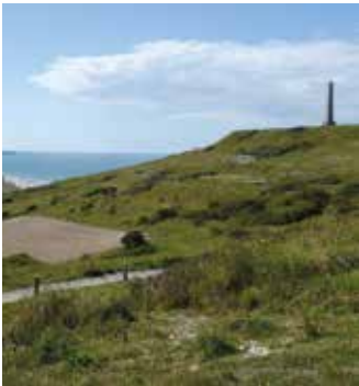
SITE DES DEUX CAPS Walk or cycle the headlands of the Channel Coast with views across the water to England on a clear day. Information, local produce and exhibitions available at the visitor centre. www.lesdeuxcaps.fr