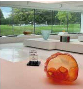
MUSVERRE, SARS-POTERIES Discover historic collections plus contemporary glass by international artists in this excellent museum in the heart of the beautiful Avesnois countryside. www.musverre.lenord.fr