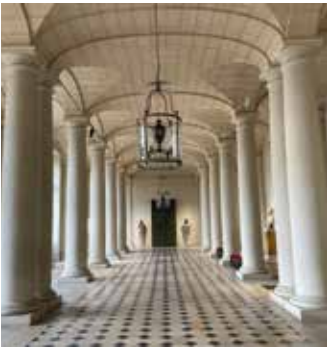
CHÂTEAU DE COMPIÈGNE This home to kings and emperors is open daily 10am to 6pm apart from Tuesdays and public holidays. Park open from 8am until 5pm-7pm, depending on season. www.chateaudecompiegne.fr