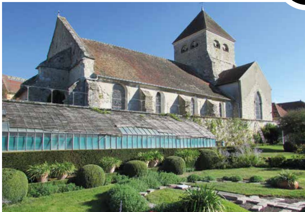
The Jardins de Viels-Maisons is a family project in Aisne on the site of an 18th-century kitchen garden

Amongst many glorious open gardens is the Jardins de Viels-Maisons , a family project in Aisne begun in 1991 on the site of an 18th-century kitchen garden www.jardins-vielsmaisons.net . Close to the Somme Bay, tour the Abbey and Gardens of Valloires www.jardinsdevalloires.fr and in Pas-de-Calais, explore the innovative themed areas of the Jardins de Séricourt – a classified jardin remarquable, www.jardinsdesericourt.com .