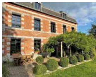
La Maison d'Aubépine in Sains-du-Nord serves up organic produce

5-star boutique hotel in a former Belle Époque bank, with newly opened restaurant, spa and additional bedrooms. www.hotel-marotte.com